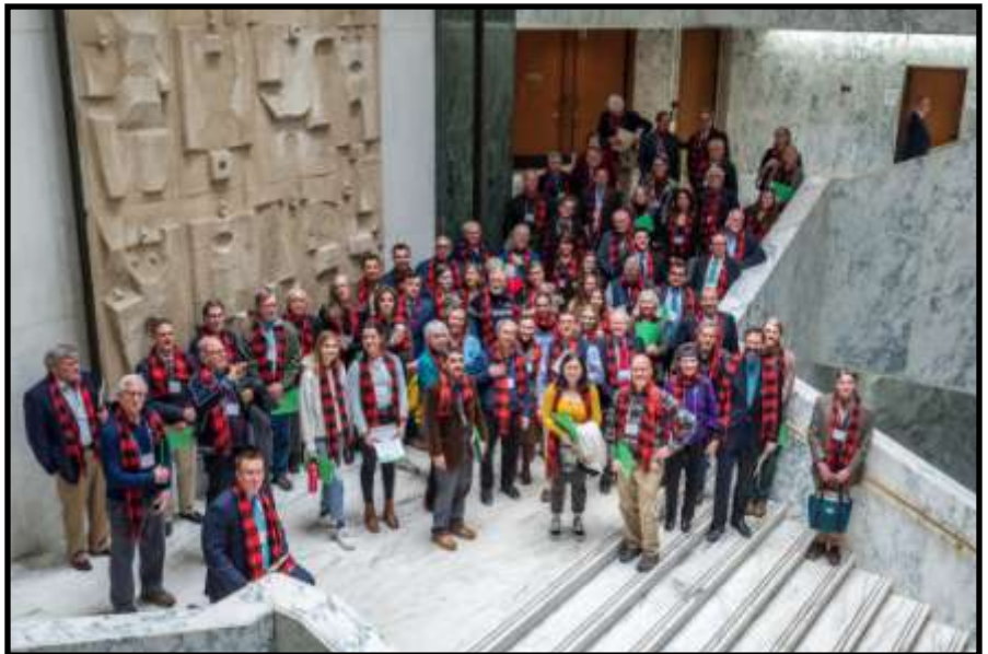
Volunteers gather in "The Well" of the Legislative Office Building in Albany to display strength in numbers before the serious ear-bending begins at individual lawmakers' offices during the Adirondack Park lobby day, Feb. 10.

According to the Adirondack Council's Kevin Chlad, meetings were set with 65 legislators and staffers and represented the largest gathering of environmental supporters in more than 10 years. Overall, Chlad reported, the advocates talked about overcrowding in the High Peaks, trail maintenance and development, educational programs, reduction of road salt use in the Forest Preserve, conservation design for housing projects and increased funding for boat inspections and washing stations.