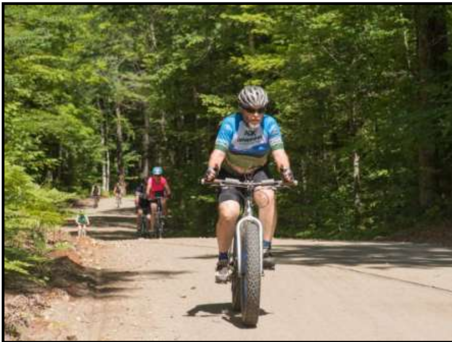
A fat tire biker navigates the "gravel-grinder" element of the Ididaride's 23 mile course during 2019's ride. Lower right bikers navigate the dirt section of the Ididaride.

Ready to start cranking out the miles? Secure your spot now in one of the best bike rides in the Northeast: Register for the 15th annual Ididaride! and support ADK at the same time. This year's ride will take place on Sunday, July 26, rolling out from scenic North Creek but with big route changes.